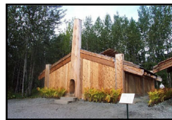
Traditional structure at the Alaska Native Heritage Center in Anchorage

Northern Building Design was funded through a grant from the Denali Commission and AIA Alaska, American Institute of Architects, from revenues generated through teaching the Northern Design Course at the University of Alaska Anchorage. APA has participated on a volunteer basis on the teaching team of the Northern Design Course since the course started in 1997.