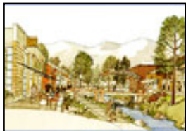
Planned Creekside Town Center from

The Mat-Su Borough has been in the process of updating its core area plan and working with communities on an area-wide basis to update community plans so they are consistent with local values. Land use guidelines remain controversial.