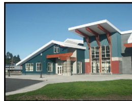
James and Elsie Nolan Center, Wrangell, Alaska

As far back as 1898, local businessmen and women pledged money and time to build a new Wrangell Museum. A generation later,