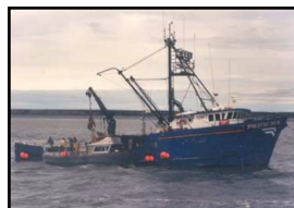
Fishing tender, Bristol Bay

In Southwest Alaska- an area that includes Kodiak Island Borough, the Bristol Bay Borough, Dillingham Census Area, Lake and Peninsula Borough, Aleutians East Borough, and Aleutians West Census Area- there are a range of projects as diverse as the region. SWAMC completed an economic geography study to define regional interdependencies and describe how the regional economy of southwest Alaska functions in relation to Southcentral and the rest of the state. The study found that southwest Alaska generated over $1.1 billion in purchases and labor income from businesses in Southcentral, and other parts of the State and U.S. According to the study, the total economic effects (eg multiplier effect) of Southwest Alaska of purchases and labor income in Southcentral and other regions totaled $3.25 billion. (See SWAMC website for more information on the economic Geography study.)