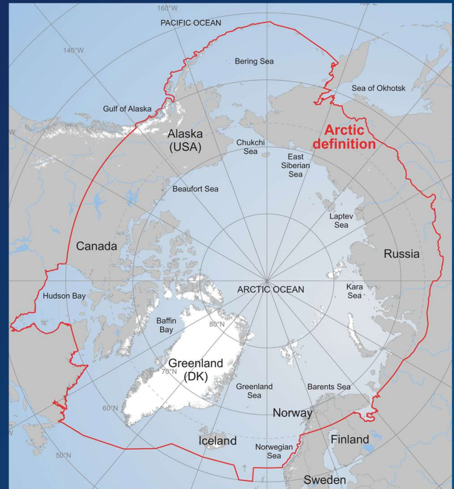
Definition of the Arctic adopted by Arctic Monitoring & Assessment Programme (AMAP), a Working Group of the Arctic Council

UAF is central to anticipating Arctic futures