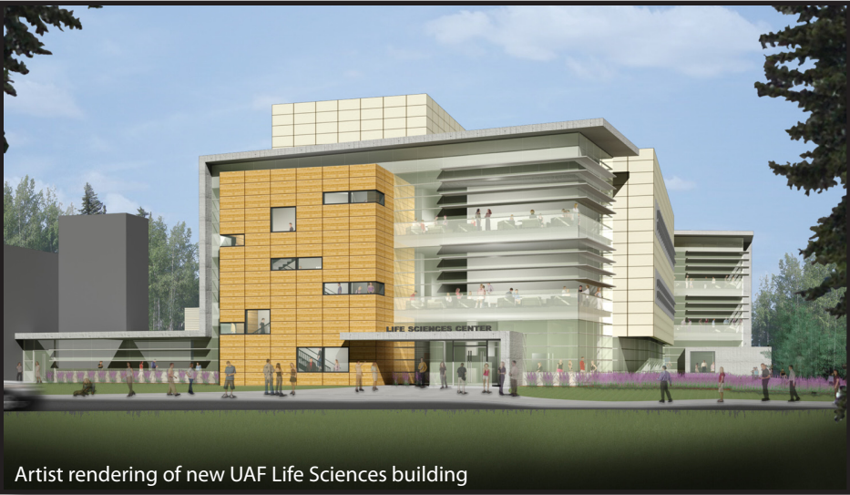
Artist rendering of new UAF Life Sciences building

Bottom Line: UA strengthens the state’s economy and workforce