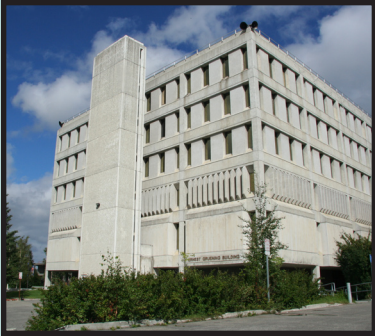
Monique Musick, UA