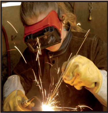
UAA Community & Technical College