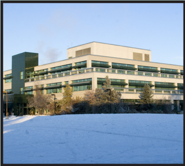
Monique Musick, UA