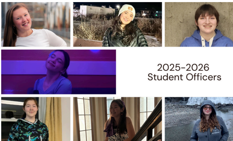
2025-2026 Student Officers