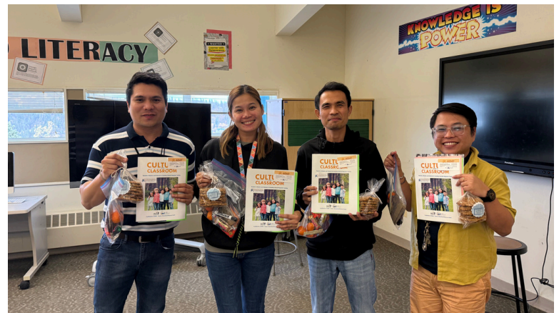
Mentees in Pilot Station, Alaska receiving their Cultural Connections books.

If you are interested in ASMP or have any questions on our program, please contact Kristy Parrish at kcparrish@alaska.edu or visit alaska.edu/asmp