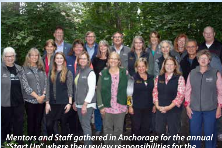
Mentors and Staff gathered in Anchorage for the annual "Start Up", where they review responsibilities for the upcoming school year.

The research results from our five-year, federally-funded, Investing In Innovations study on the effectiveness of our mentoring program in urban districts are in and can be found at www.asmp.alaska.edu . ASMP mentoring had statistically significant impacts on student achievement in primary reading and secondary mathematics for specific groups of students. In addition, third-year retention rates for ASMP-mentored teachers were higher than their non-ASMP counterparts.