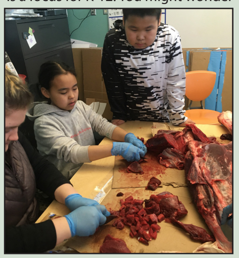
K-12 students in Akiak participating in processing moose meat. Yupiit School District incorporates cultural knowledge in their curriculum, including spring and fall moose hunts.

Place-based teaching connects a student's individual background and life's experiences (individual culture) to learning—and as a result, students are more engaged and committed to learning. K-12 oversees three programs, Alaska Teacher & Personnel (AT&P), Educators Rising and the Alaska Statewide Mentor Project (ASMP). Each of these three programs has opportunities for using place-based teaching and cultural pedagogy in their work. Teaching through culture is a focus for K-12. You might wonder