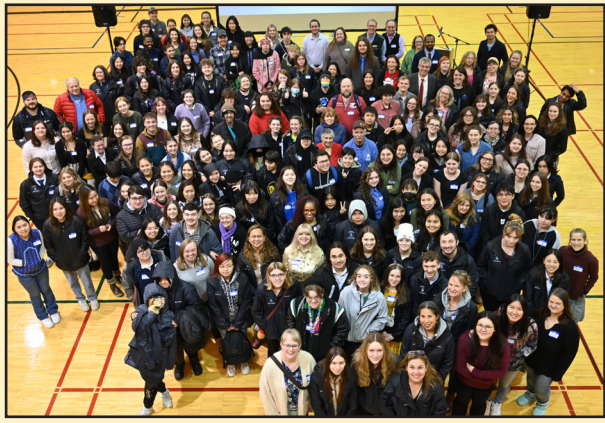
EdRising 2024 State Attendees gathered for a group photo in the UAS Recreation Center following the Opening Ceremonies.

competitions give students an opportunity to compete in various events that demonstrate their knowledge and leadership in education. Those students who participate and place in the top 10 of their competitions