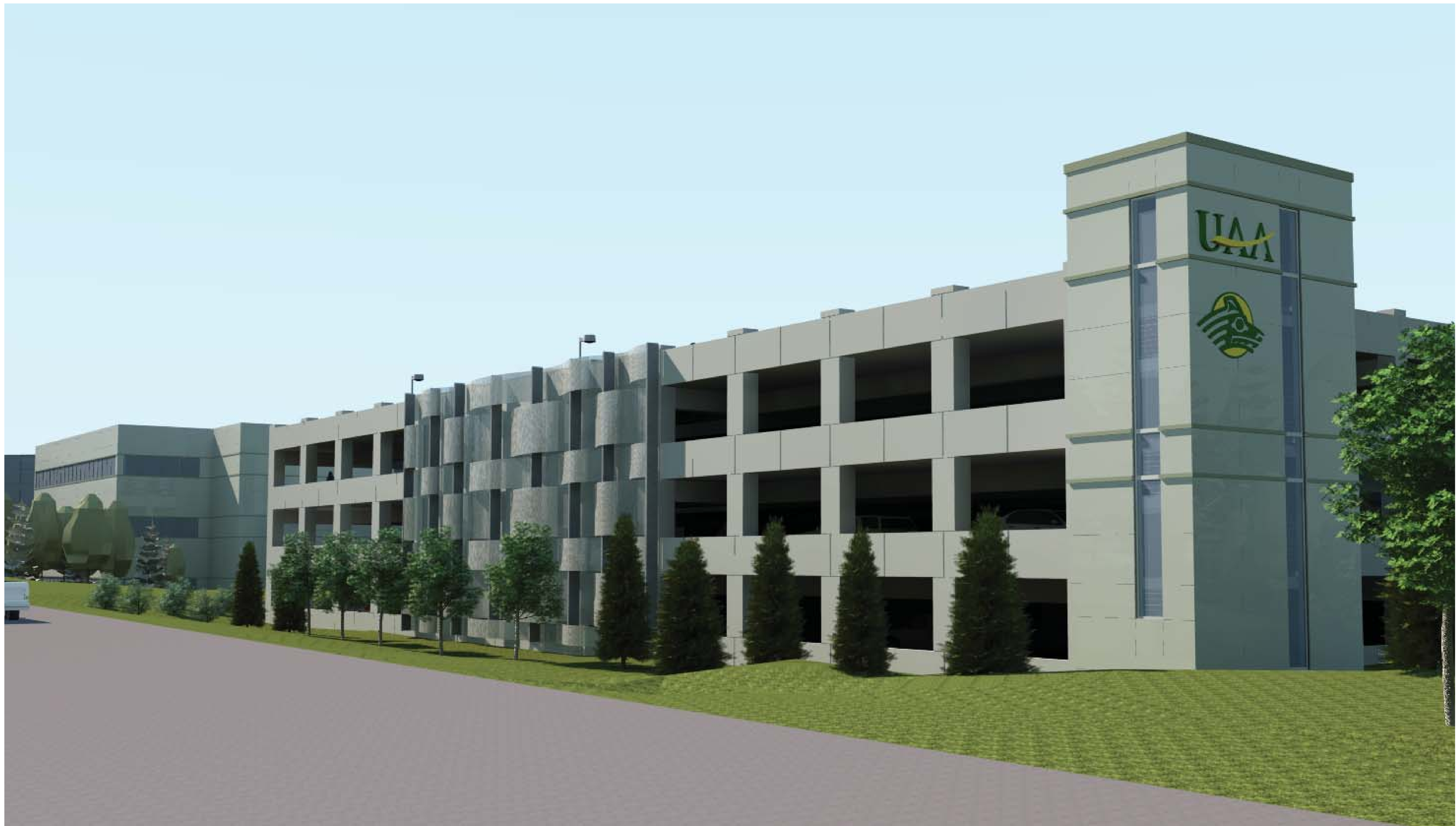
View from UAA Drive looking South