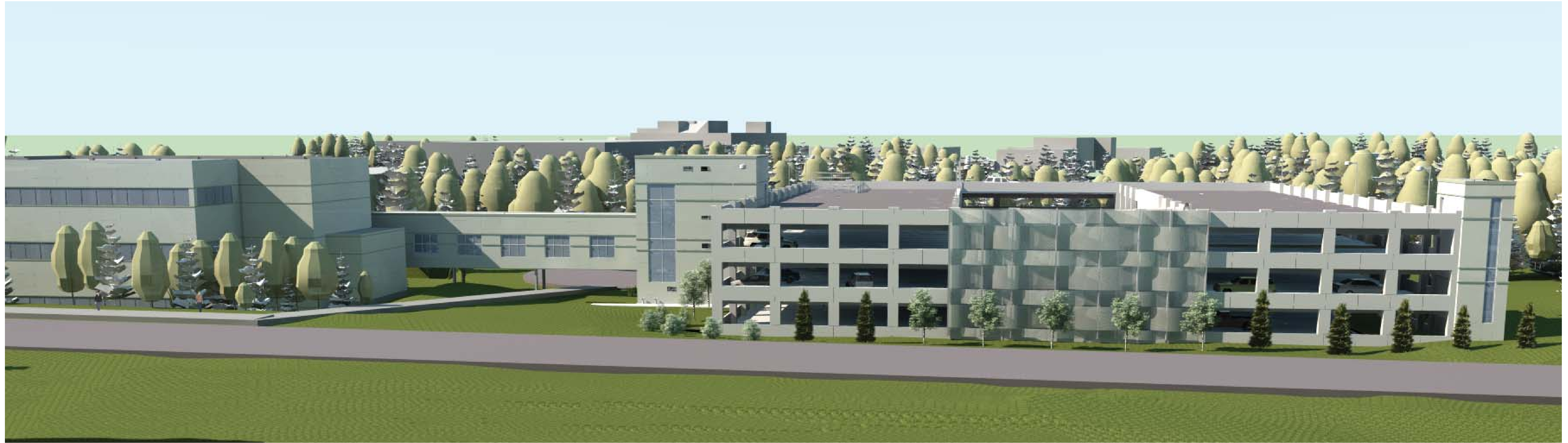
Elevation from UAA Drive