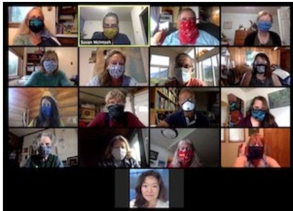
ASMP Mentors and Staff meet on Zoom regularly, sharing knowledge, training, organizational updates, and insights.

This school year, the same group of mentors have returned with fire and purpose. They are