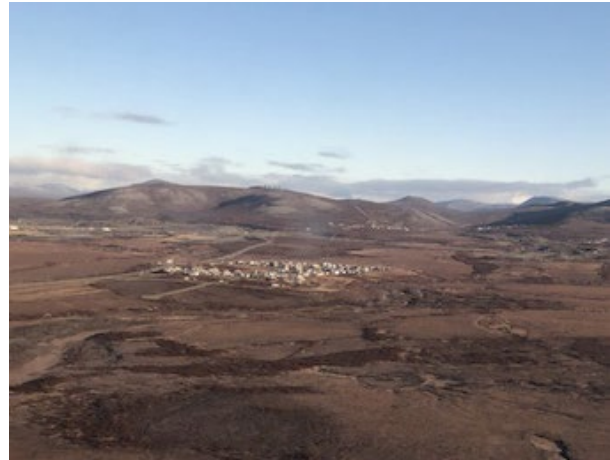
Flying into Nome, in early October.

between our Hawaiian and Alaskan partners.