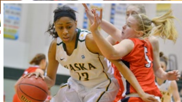
Seawolf women are NCAA bound, earning an at-large bid to the 2014 West Regional Championship.