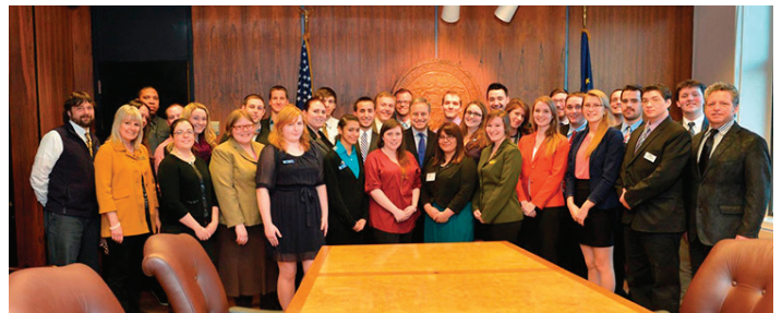
Students met with legislators and the office of Governor Sean Parnell. This year's theme was "Helping Build Alaska's Future". Here they are with Governor Parnell.

Forty students from all over Alaska participated in the annual UA Legislative Affairs conference February 1-4, 2014.