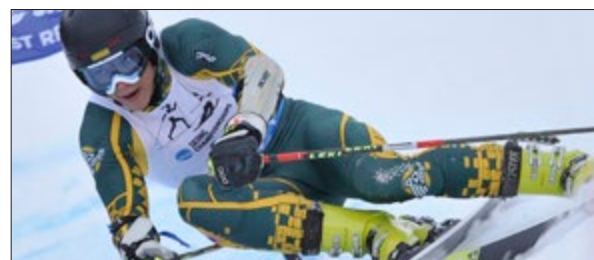
UAA qualified a full 12-athlete team to the 61st NCC Skiing Championships and finished eighth, capturing its seventh-straight top-10 result.