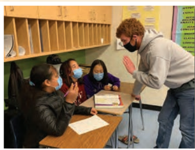
Improved Student Learning & Growth