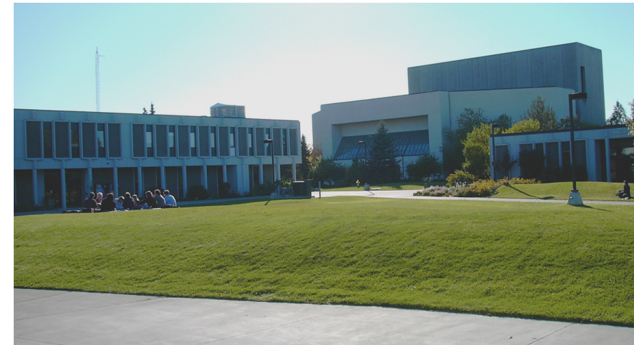
The original west campus buildings are sited in close proximity which allows for quick access between them during severe winter conditions. The garden quads between them give the west campus its special identity.

The UAA campus master plan is intended to be a practical reference document that will be regularly used by administrative and facilities staff to guide all levels of decision-making for the betterment of the campus and the institution.