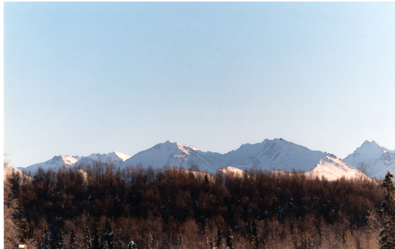
A view of the Chugach Mountains from the UAA campus.