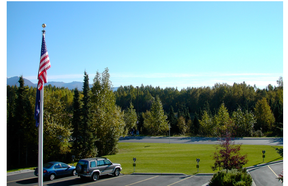
Alumni Drive forms an edge to Mosquito Lake and its surrounding wetlands. Glimpses of the lake from nearby buildings enrich the sense of place that is unique to the University.

Long term edges of campus development are identified in the master plan, and it is recommended that green buffers be conserved or planted to protect and separate facilities from future outside encroachments. The image of an urban university in a wild Alaskan landscape is compelling but incomplete. By extending the natural landscape as a green buffer around the perimeter of development, the identity of the campus will be strengthened. In some places, plantings will literally extend the natural landscape; in others, more controlled, man-made landscaping will be appropriate.