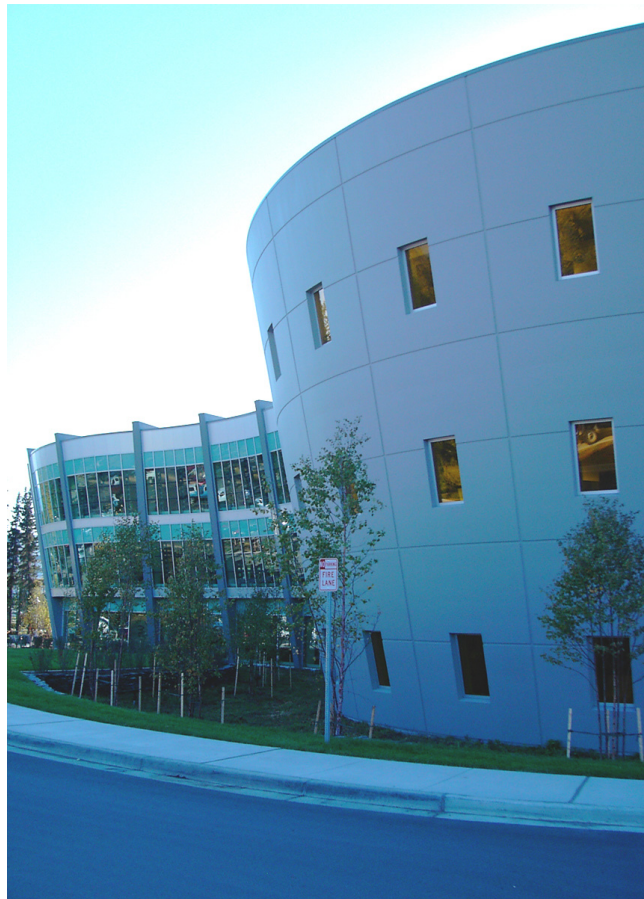
The new library addition is an imaginative example of northern sub-Arctic architecture.