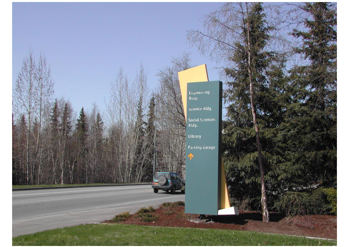
Consistent signage is a way to promote a clear identity for the University in an otherwise diverse campus.

The Master Plan identifies a series of guiding principles that are fundamental to appropriate and consistent design on the campus. Arising from these is a series of key design guidelines. The guiding principles on page 30 have directed the master plan process; the key design guidelines beginning on page 34 are intended to steer implementation of the master plan to fulfill the guiding principles.