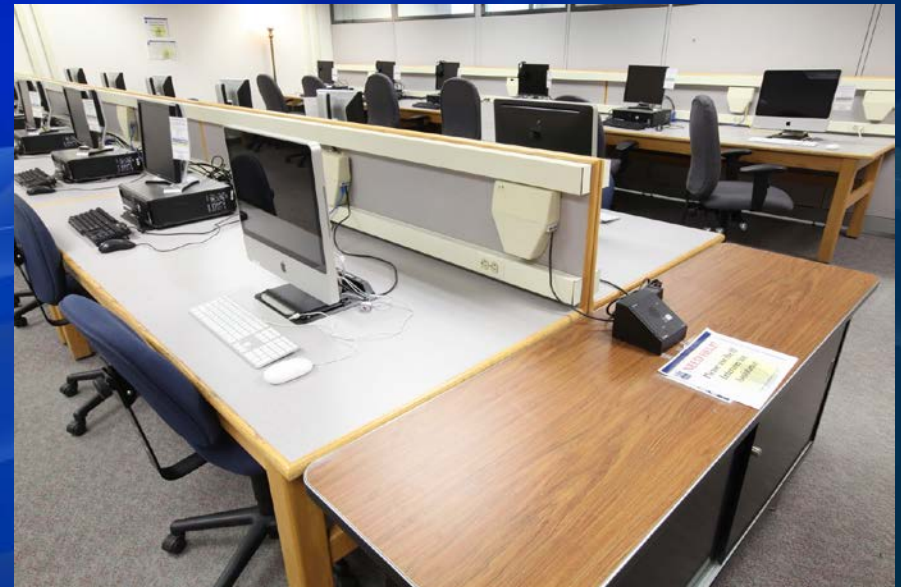
Old lab space