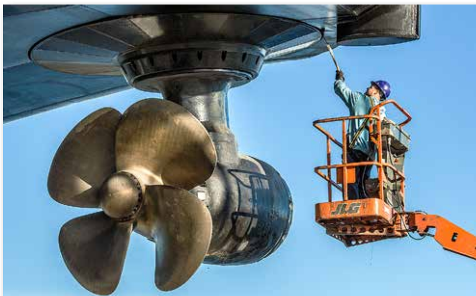
An employee at the Marinette Marine Corp. puts a final coat of paint near one of the rear propellers of the R/V Sikuliaq the day before it was christened. Hundreds of people endured wind and rain Oct. 13 to attend the launch ceremony for the 261-foot vessel, which is owned by the National Science Foundation and will be operated by the School of Fisheries and Ocean Sciences.