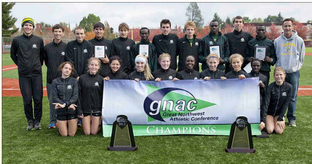
UAA men and women's winning cross country teams.